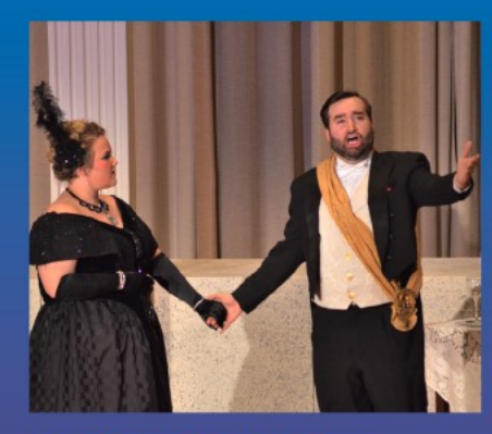
AUDITION DATES Friday, February 7, 2020 Saturday, February 22, 2020 Saturday, February 29, 2020